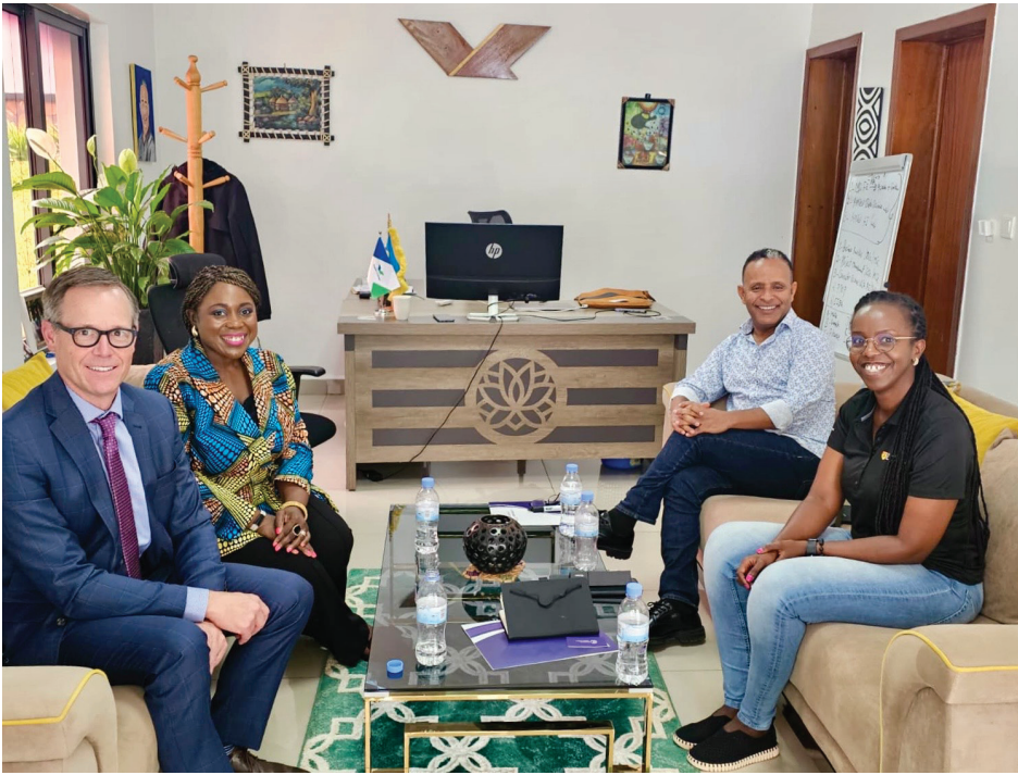
Kepler College, Rwanda