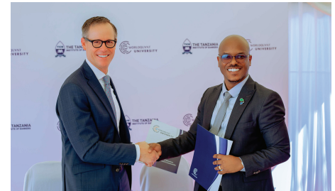
Tanzania Institute of Bankers