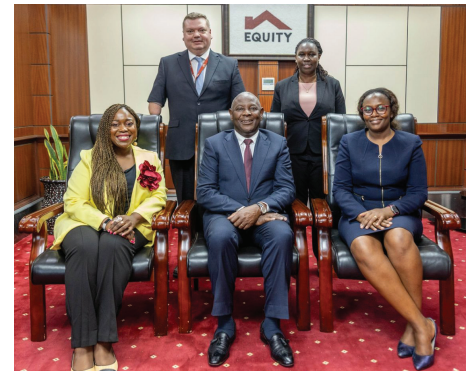
Equity Group Foundation, Kenya